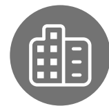
Table of Content